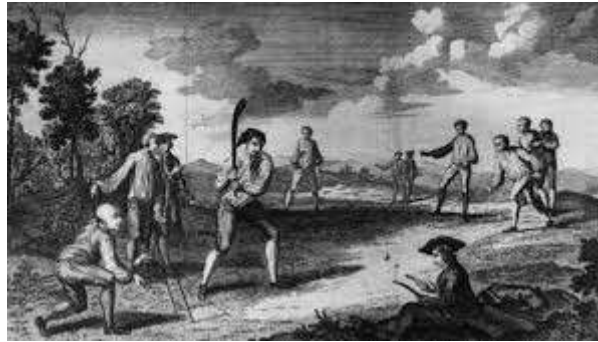
Early Cricket 1721

By and large the game continued to be played by children for generations, and is defined in a dictionary of the day as a ' boys' game '. Played in clearings, or on pieces of land grazed by sheep, the earliest items of equipment may well have included a matted lump of sheep's wool, or a small lump of wood, or even a stone, to serve as the ball. A stick served as the bat, and a tree stump, or a wicket-gate, functioning as the wicket.