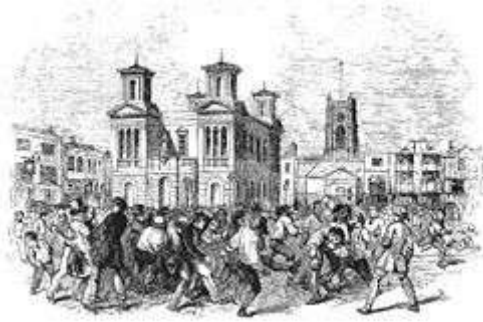
Early football by the Thames

England was the first country to develop a ' kicking game ', similar to that of modern day football, and there is compelling evidence to suggest that in the county of Nottinghamshire team games were being played in schools as early as 1581. While the origins of the game of cricket remain a mystery, from the collection of folklore and fact expertly assembled over time, it is likely a simplified version of the game was played by children living in the south-east of England, in the counties of Kent, Sussex and Surrey, a region of the country then known as the Weald.